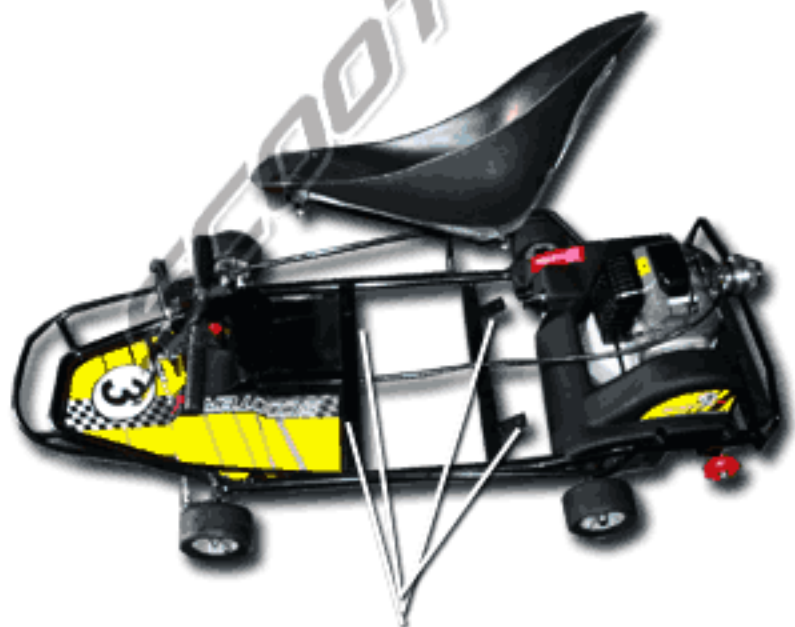
Pre Drilled Holes

Before riding your kart be sure to check that all nuts and bolts are secure. This is extremely important.